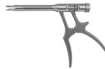
Pistol Grip Rod Reducer

Sequential Reducers are designed to provide controlled reduction and correction up to 15mm and are cannulated for set screw insertion capability.