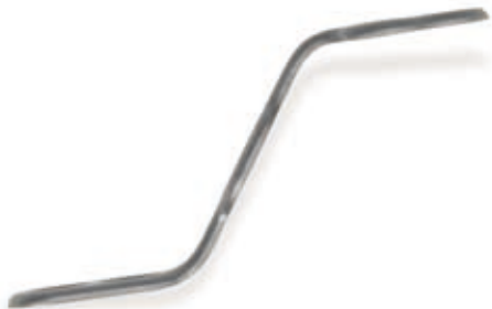
Side View of Standard Plate