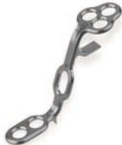
Plate with Hook

Double bend plates enhanced with a buttress against the lateral mass and a hook against the open lamina to stabilize the lamina in the open position as screws are inserted.