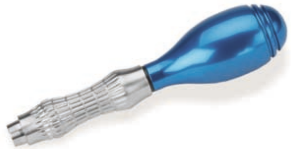
Quick Connect Handle