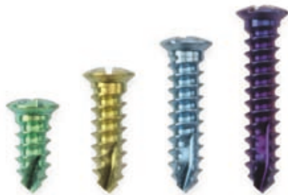
Self-Drilling Screws 2.4mm Diameter