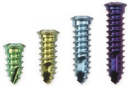
Self-Drilling Screws 2.8mm Diameter