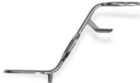
Side View of Plate with Hook