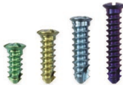
Self-Tapping Screws 2.4mm Diameter