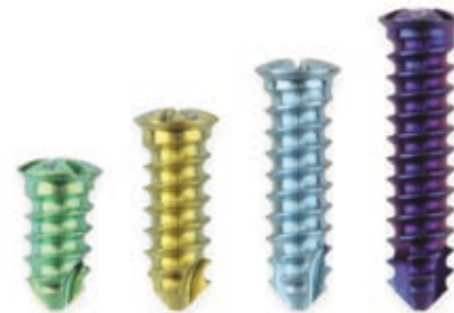
Self-Tapping Screws 2.8mm Diameter