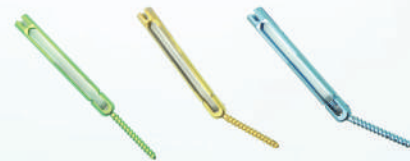
Polyaxial Reduction Screw