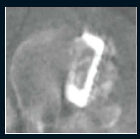
CarboClear® Lumbar Cage: CT