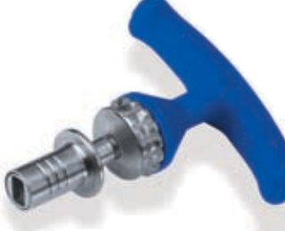
Z-Connect T-Handle Ratchet