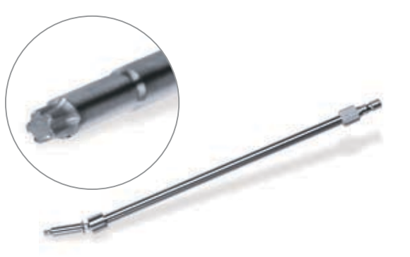
Universal and Rigid Pentalobe Drivers