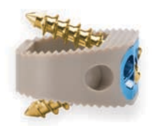
Acute shallow screw angle provides strong fixation by optimizing thread contact with cortical bone

Large, single chamber design accommodates the fusion process