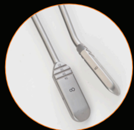
Straight and Angled Instrumentation