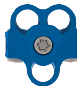
Anterior Fixation Plate

Open Anteriorly for Modular Plating Options